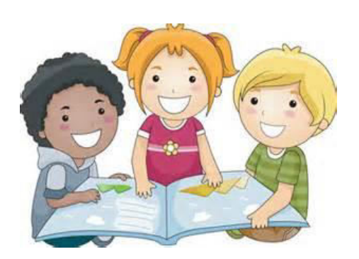
First Grade into Second Grade Summer Reading Program